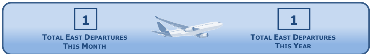
East Departures Yearly Comparison

The number of East Departures may vary from month to month due to weather, air traffic volume, and/or operational factors.