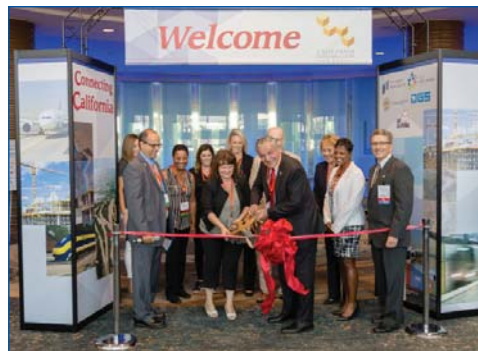
CalCon host agency representatives and state and local elected officials kick off the 2016 Expo.

"Design, Build, Progress" was the mantra of the 2016 California Construction Expo, held at the Long Beach Convention Center on July 28. More than 1,000 construction industry professional attended the expo hosted by Los Angeles World Airports (LAWA), Port of Los Angeles, Metropolitan Water District, California Department of General Services, and the Association of General Contractors-CA. CalCon is the state's premiere gathering for contractors, designers, construction professionals, suppliers and construction workers interested in public sector projects.