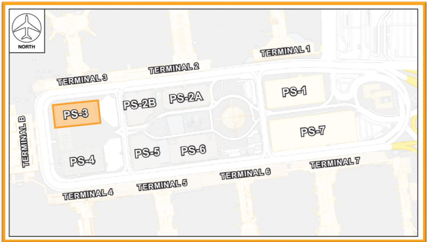
Example of PGS System (top) and Parking Structure 3 location (bottom)