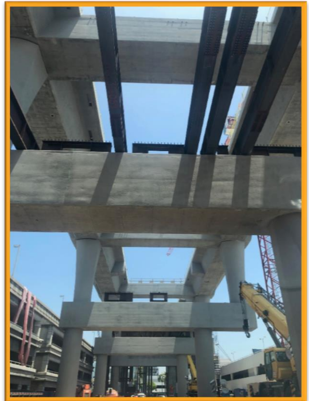
APM East CTA Station Construction Progress